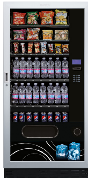
Fast DG 900