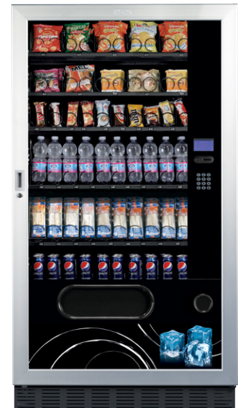
Fast DG 1050