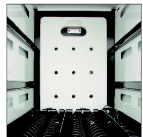
Eutectic plate for maintaining the temperature during power failure